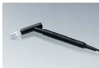
45° detachable Probe