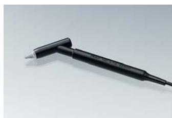
45° fixed Probe*2

The US-4000 / 500 pachymetry mode offers precise measurement of the corneal thickness within a \pm 5 \mu\text{m} error.