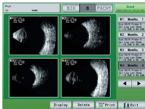
Multi Image Display Function

The results are high quality images, which are essential for accurate analysis. The key to achieving high quality images is through scanning 400 lines over 60° which is displayed on a 1024 x 768 XGA monitor. High contrast of resonated signals and the high quality LCD monitor provide the ideal images for the most accurate diagnosis.